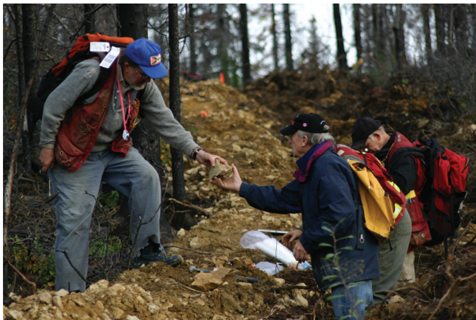
Examining rock samples in trenches at the Mariposa Project

The 35 sq km Fyre Lake property lies approximately 250 km east of Whitehorse in southeastern Yukon Territory, and hosts “Besshi-type” (stratiform and tabular) copper-gold-cobalt volcanogenic massive sulphide mineralization. Exploration to date has partially drill-defined the Kona massive sulphide deposit and outlined a number of satellite targets with potential for additional VMS deposits.